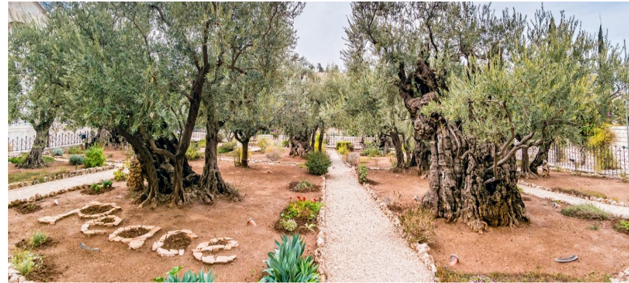
The Garden at Gethsemane