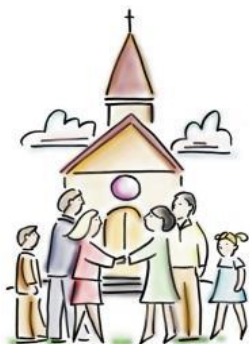
POINTing the Way!